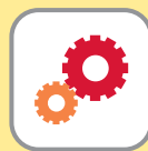
The Start-Up Phase