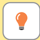
The Idea Phase

You will face different challenges and different needs at each phase of the business development process. North Carolina agencies and organizations provide support throughout the business development cycle. It can be helpful to think of the business lifecycle as proceeding through three main phases: