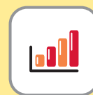
The Growth Phase

This guide describes what we have in North Carolina to help you at each of these stages. Within any of these stages you will come to crossroads where you need to make important decisions, so we are including a fourth section on Resources for Key Decisions.